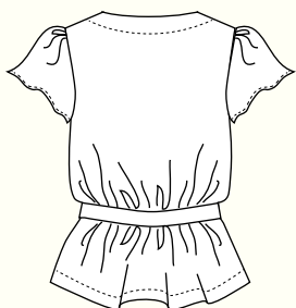
B - BACK

© 2014 Sewaholic Patterns | Made in Canada | Printed on recycled paper